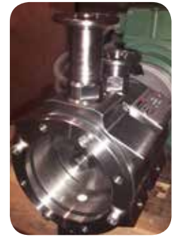
JEB1.1 with clear front cover and drain valve

The JEB Series eccentric disc pump is the ideal solution for the transfer of shear sensitive fluids. From liquids to viscous products, the JEB has been designed to guarantee integrity and quality of the product pumped in ensured hygienic conditions.