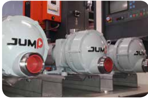
JEB5 on stationary stainless steel base plate