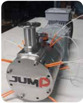
JEB1.1 with heating jacket