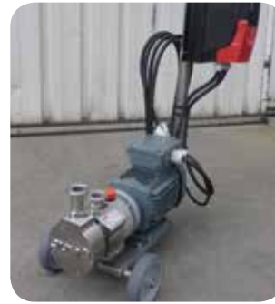
JEB1.1 on mobile trolley